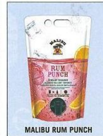
MALIBU RUM PUNCH