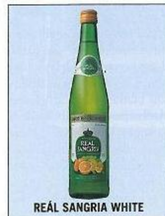
REAL SANGRIA WHITE